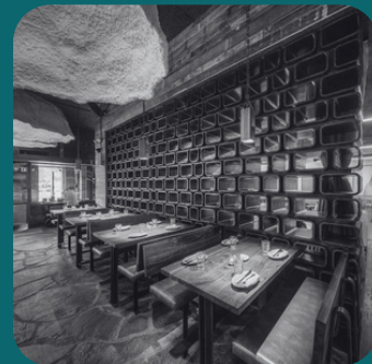
Barcelona Wine Bar